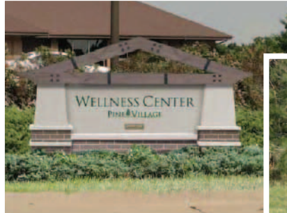
In front of Wellness Center