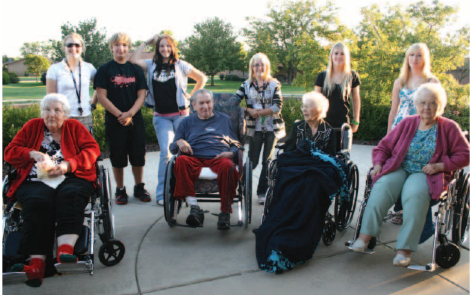
Pine Village residents with FCCLA members

Each year the funds raised through the Benefit Day events are designated for a specific project. This year the funds will be used to refurbish the Krehbiel Apartments commons area and hallway. The Apartments were built in 1994 and include 19