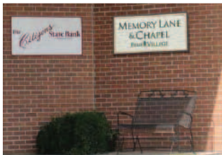
Memory Lane & Chapel