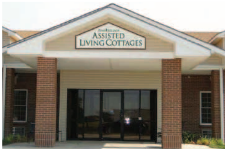
Assisted Living Cottages