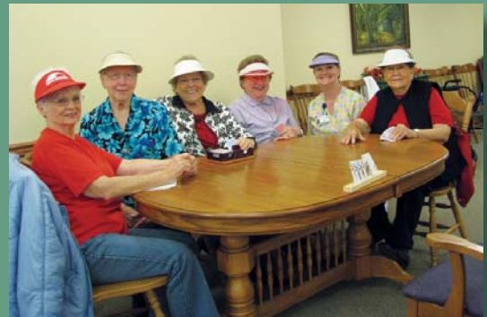
Residents and friends play cards weekly in the new Assisted Living Dining room.