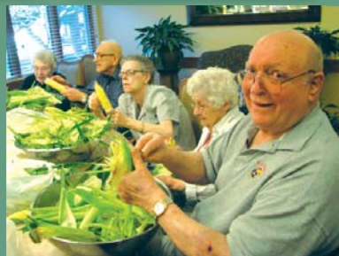
Residents help to shuck corn during this year's corn harvest!